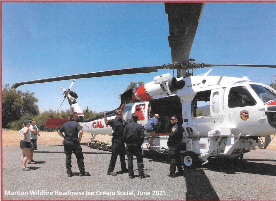
Manton Wildfire Readiness Ice Cream Social, June 2021